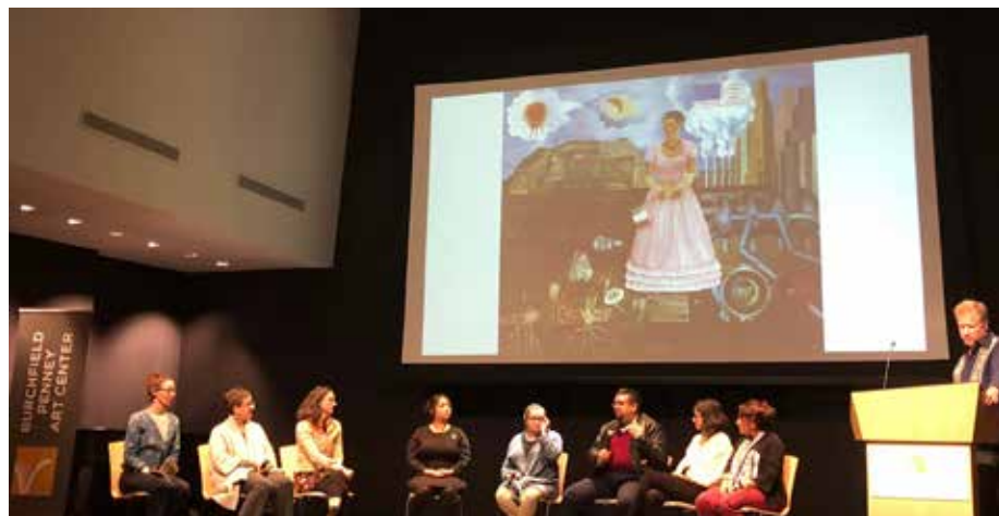
The Global Film Series featured a panel on migration and immigration